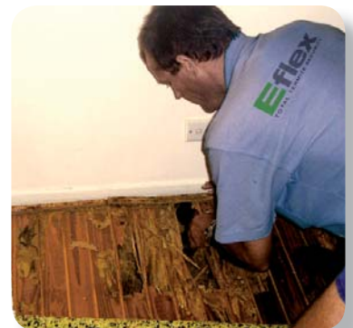
TERMITE DAMAGE TO FLOOR - CONCEALED BY CARPET