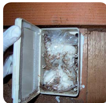
INSPECTION OF EXCEL STATION BY EFLX ACCREDITED OPERATOR