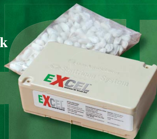
EXCEL TERMITE BAITING STATION COMPONENTS

When you have found termite activity in your home.