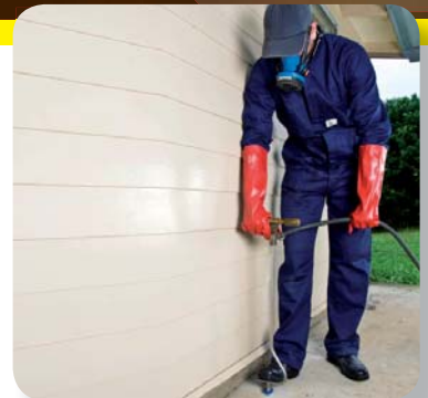
DRILLING AND INJECTING BARRIER