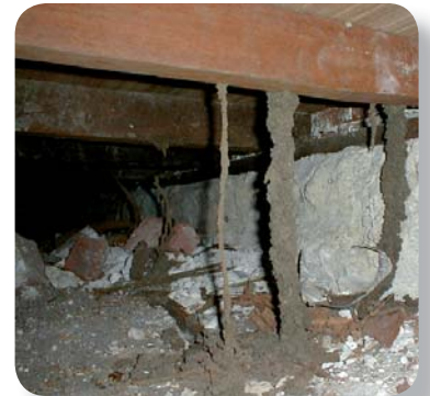
TERMITE ATTACK TO SUB-FLOOR AREA