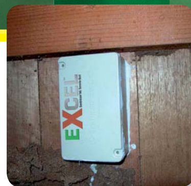
MOUNTED EXCEL ABOVE GROUND STATION AFFIXED TO TERMITE ACTIVITY

Biflex and Excel – the best of both worlds.