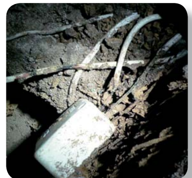
TERMITE DAMAGE TO ELECTRICAL CABLES