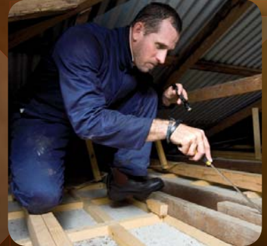
INSPECTING ROOF TIMBERS

Please check our website for more details at www.Eflex.net.au