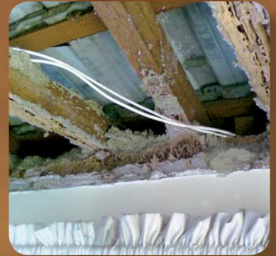
TERMITE ATTACK TO ROOF STRUCTURE (CEILING REMOVED) OF DOUBLE BRICK HOME

Unfortunately for our homes, they do not discriminate between dead or decaying timber and other cellulose-based building materials. Even electrical conduit is not exempt.